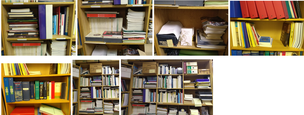
Figures 7-21: Overview of the Federation room's library collection on shelving units