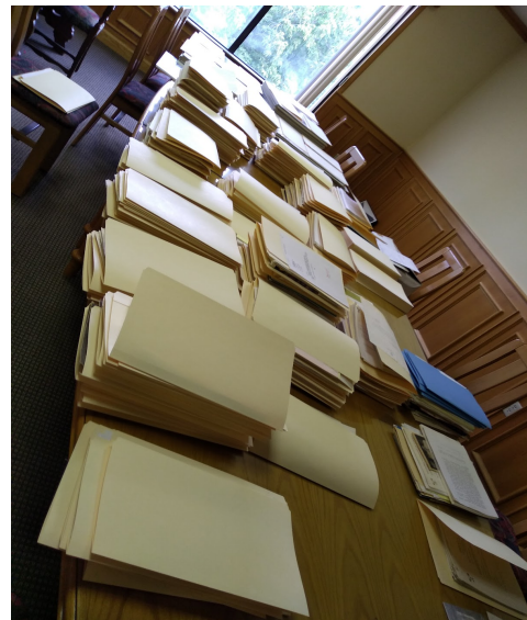
Figure 6: The textual records transferred to new, archival-standard file folders

Step 3- Transfer & Secure: 500 archival-standard, acid-free file folders were purchased from Uline, along with 10 archival-standard, acid-free boxes (the Famee Furlane of Toronto had one of these boxes left over from last summer's project). The textual records were then transferred from their original non-archival standard file folders into the new acid-free ones, which were then transferred into the new acid-free boxes. Four of the original boxes had to be used because the eleven new boxes did not have enough room. Additionally, any paper clips were removed from the documents, as these cause rust that damages documents; they were replaced with stainless-steel paper clips when necessary.