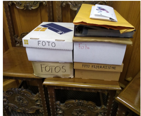
Figure 56: The Federation's collection of photographs, stored in their original boxes