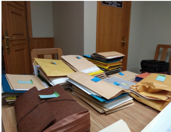
Figure 5: Organization process of the original files

records. It was decided that the focus for this summer's project would be archiving the textual records.