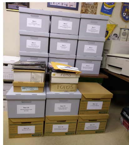
Figure 55: The Federation's textual records, stored in their new archival-standard boxes (now labeled)