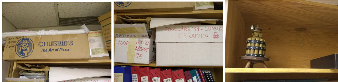
Figures 50-52: Collection artifacts in boxes on the shelving units