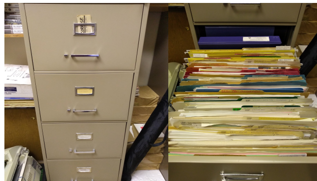
Figure 1 (Right): Original files containing textual records in original box at the start of the project