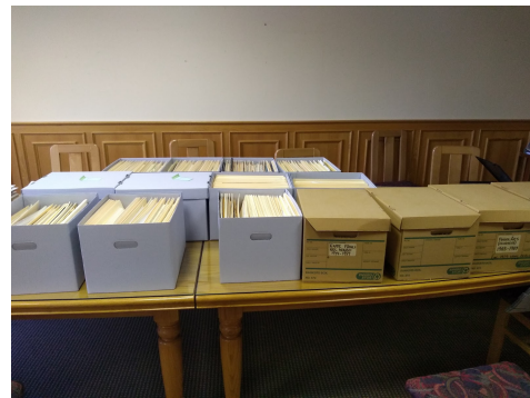
Figure 54: The Federation's textual records, stored in their new archival-standard boxes

Extent: These records make up the majority of the archival material. They consist of approximately 173" (14.4 feet) of textual records in 505 files.